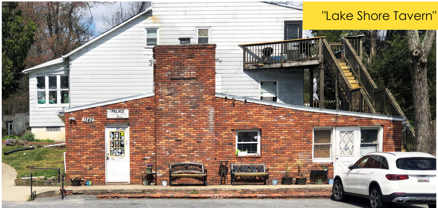
"Lake Shore Tavern"