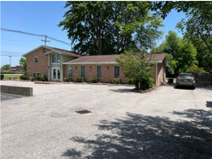
4516 Outer Loop- Exterior 2