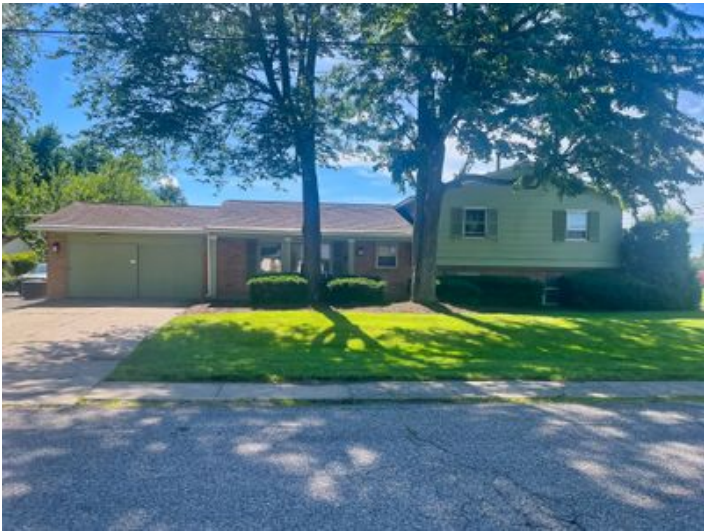
4516 Outer Loop- Exterior 3