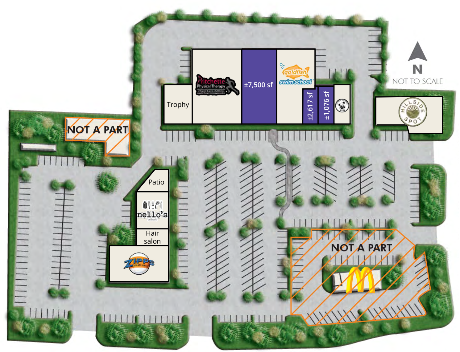
Warner Road ±51,200 cpd