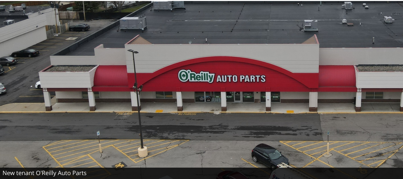
New tenant O'Reilly Auto Parts