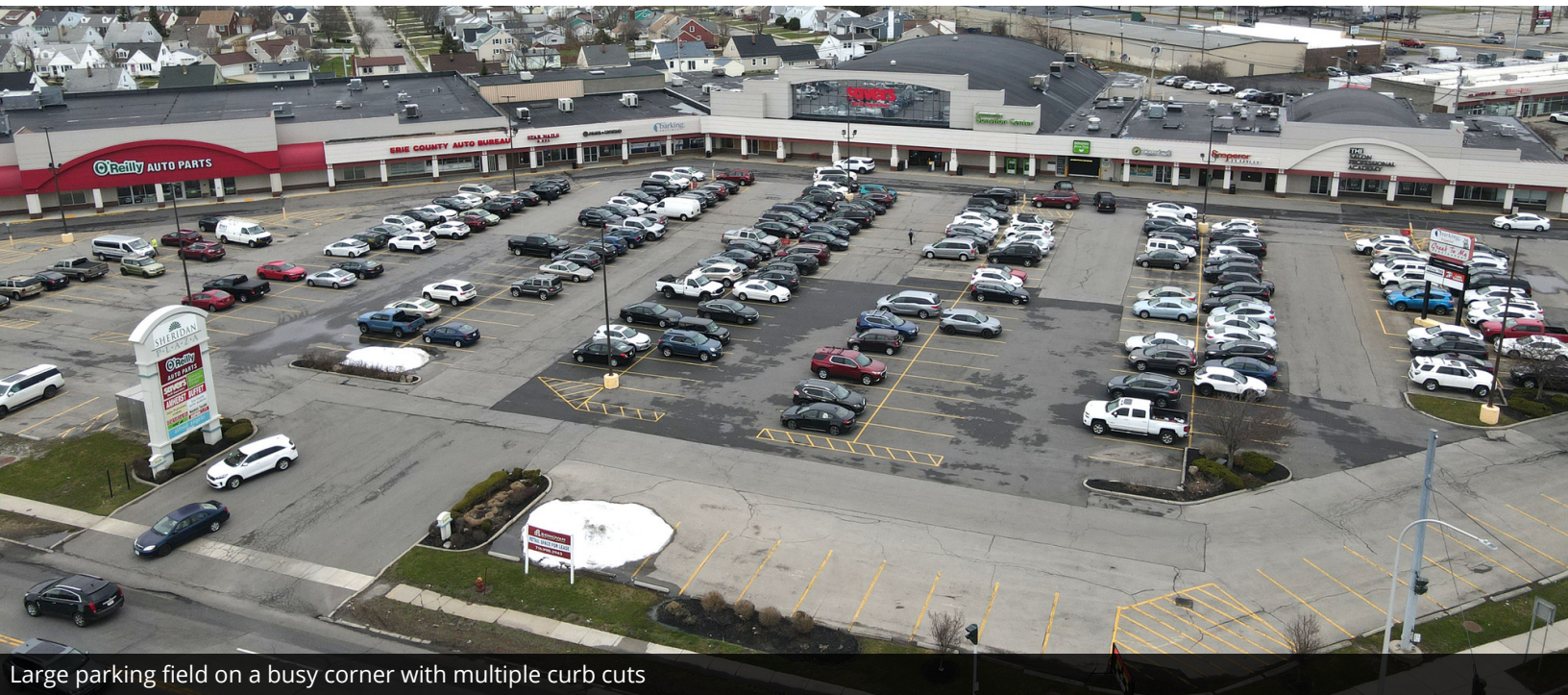
Large parking field on a busy corner with multiple curb cuts