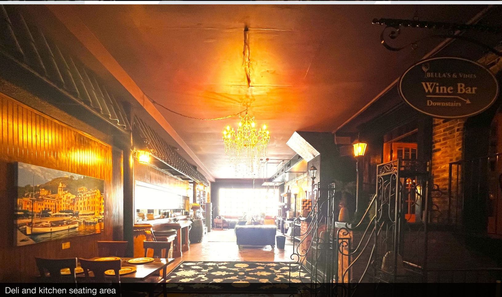
Deli and kitchen seating area