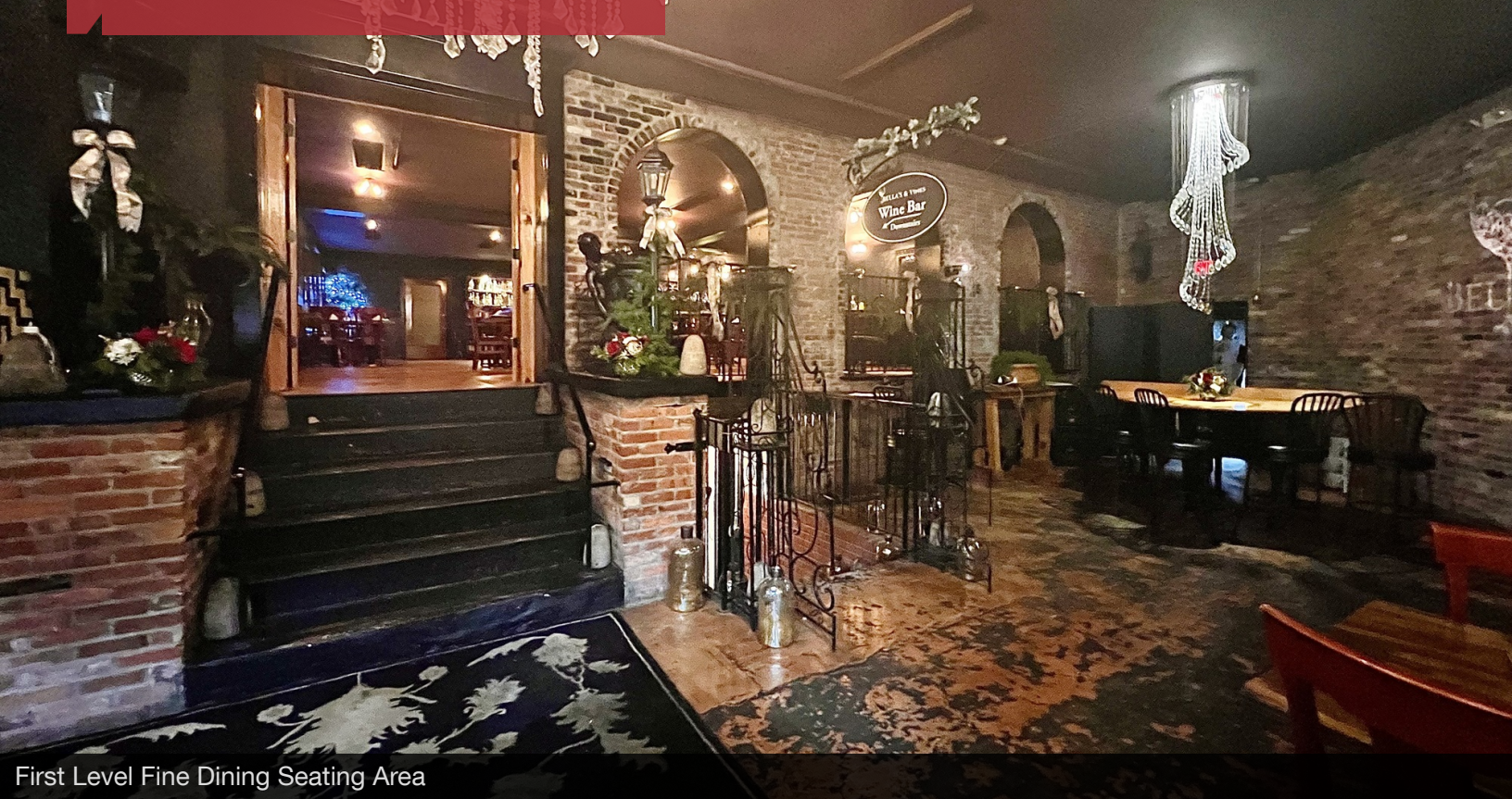
First Level Fine Dining Seating Area