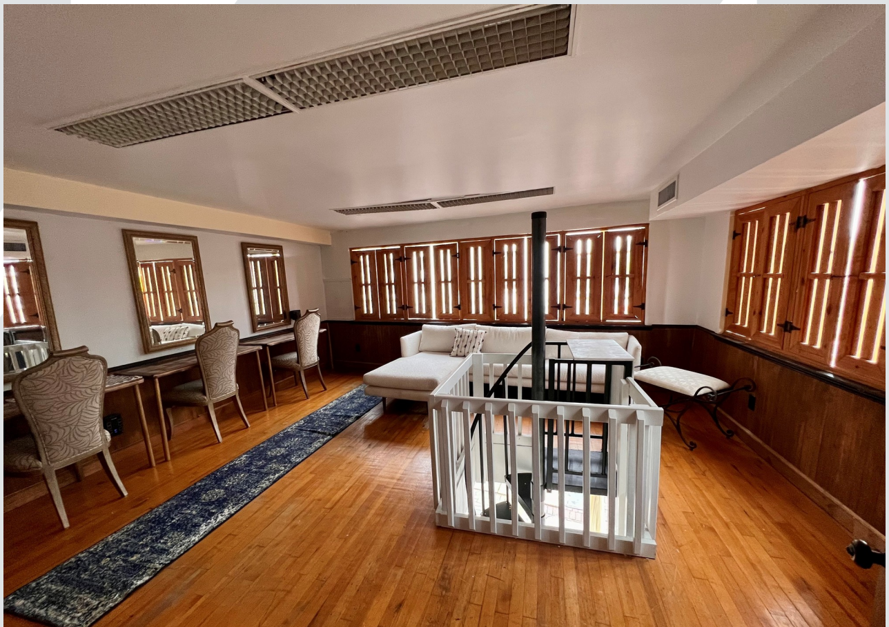
3rd room in Bridal Suite with spiral staircase leading back down to the Ballroom