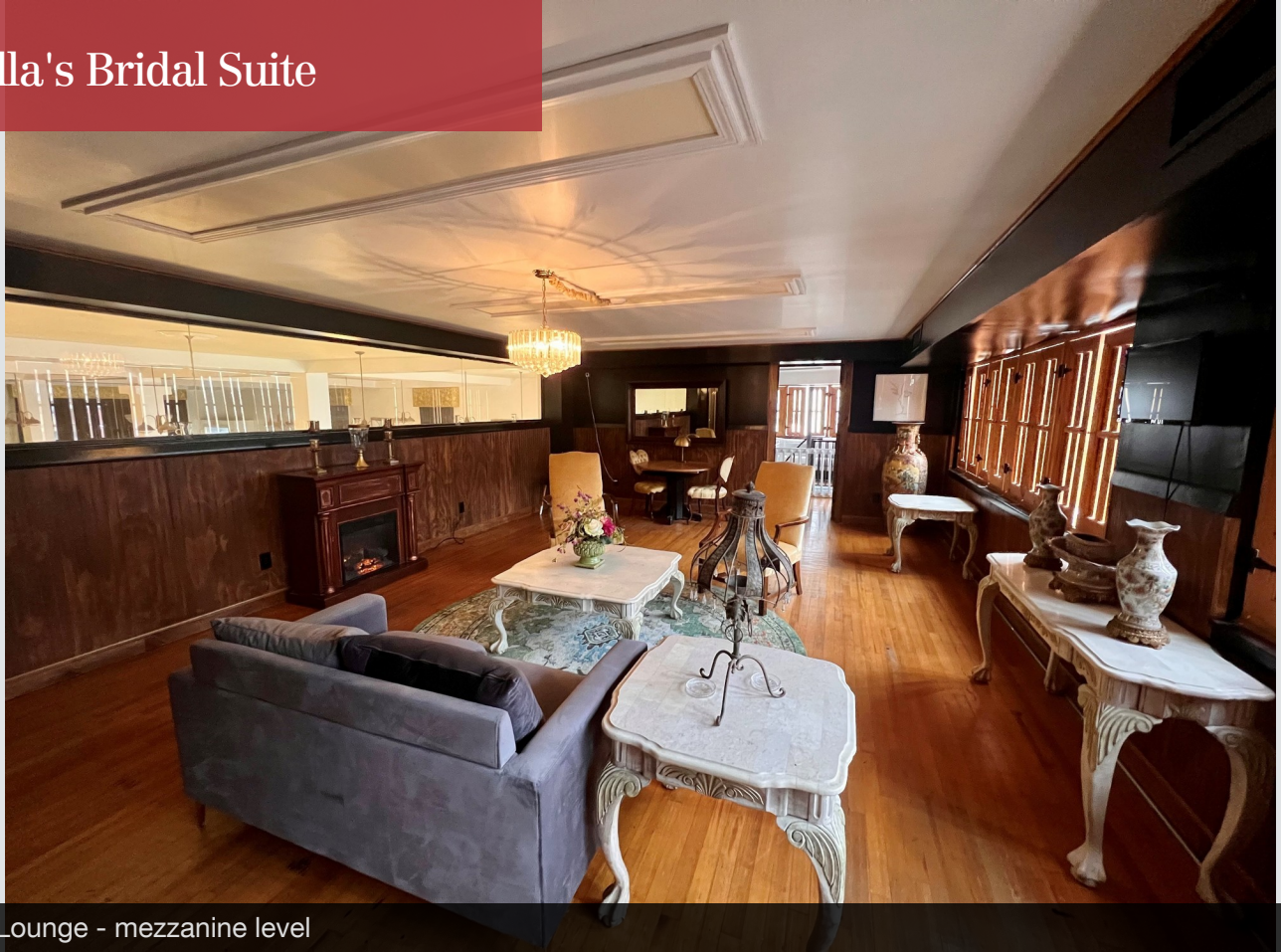
Bridal Suite Lounge - mezzanine level