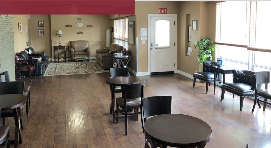
Main floor, open area

21440 SE Stark Street, Gresham, OR 97030