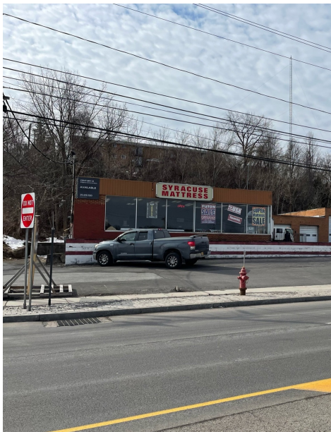
Highly Visible Location