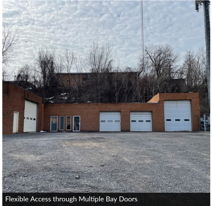
Flexible Access through Multiple Bay Doors