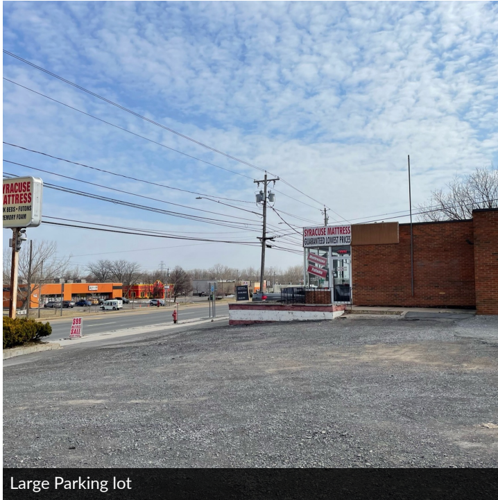
Large Parking lot