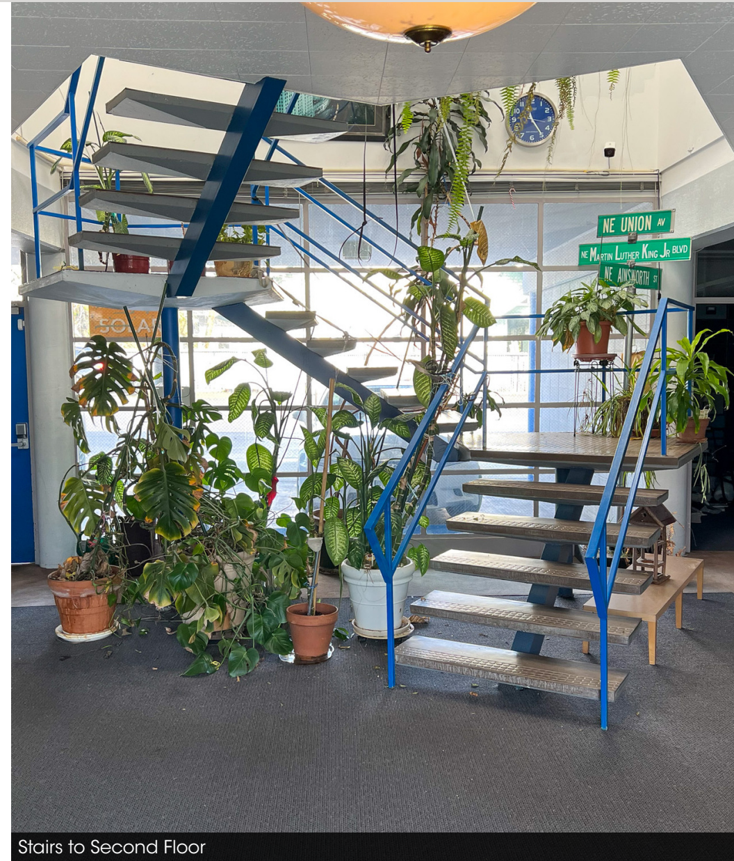
Stairs to Second Floor