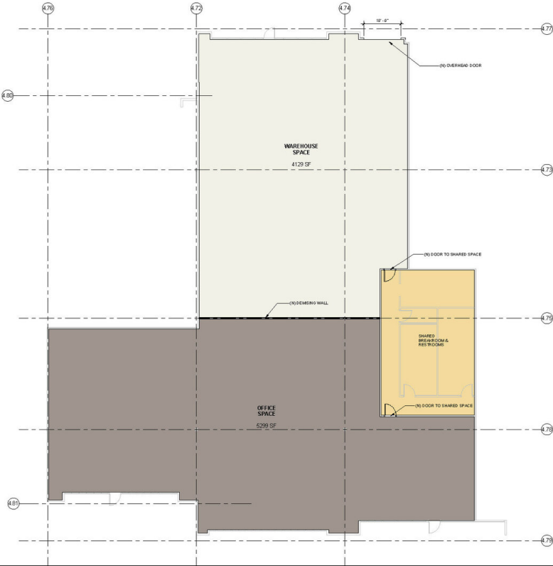
Potential Floor Plan