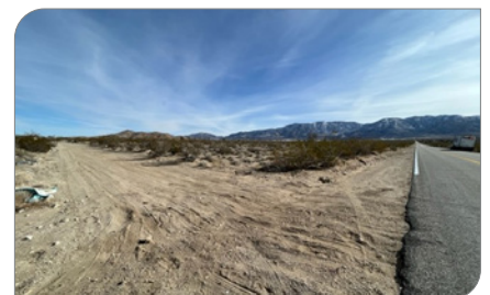
N.W. Site Corner with S.E. View

Lee & Associates Commercial Real Estate Services - Orange, Inc. DRE# 01011260 714-647-9100 LEEORANGE.COM