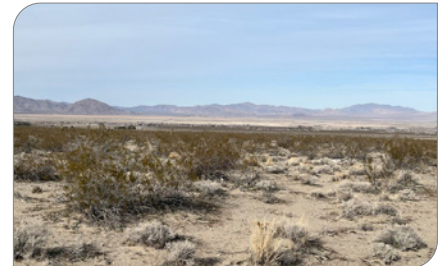
North View from South Property Line