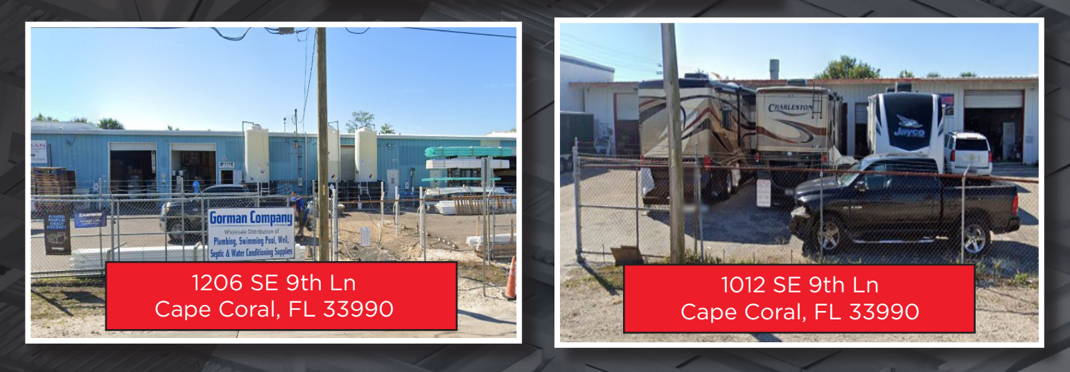
Cushman & Wakefield | Commercial property Southwest Florida Copyright May 11, 2023 4:49 PM. No warranty or representation, express or implied, is made to the accuracy or completeness of the information contained herein, and same is submitted subject to errors, omissions, change of price, rental or other conditions, withdrawal without notice, and to any special listing conditions imposed by the property owner(s). As applicable, we make no representation as to the condition of the property (or properties) in question.