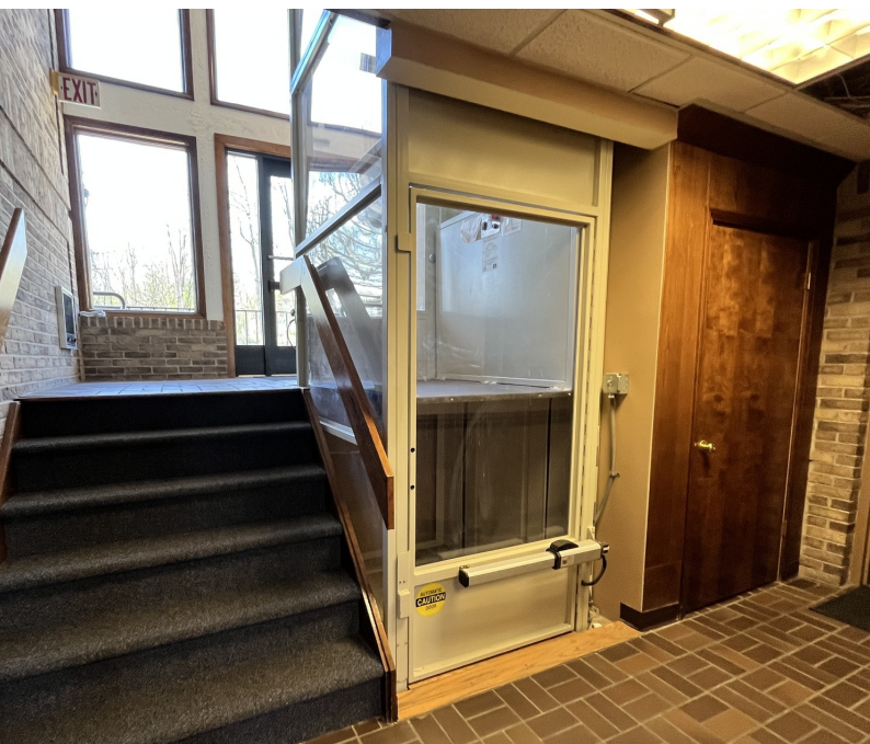
Wheelchair lift for access to all floors from rear entrance