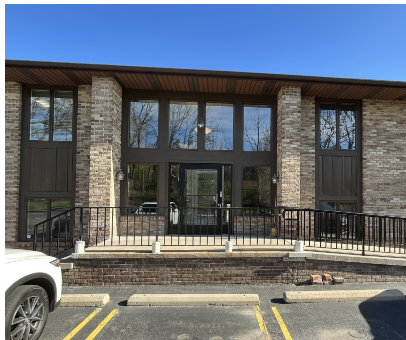
Rear entrance has steps and a ramp for access