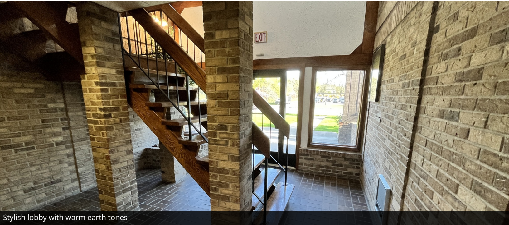
Stylish lobby with warm earth tones