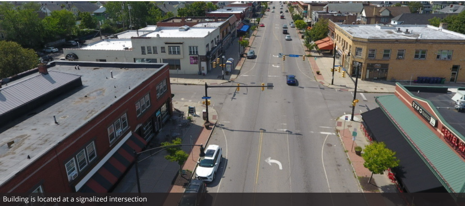
Building is located at a signalized intersection