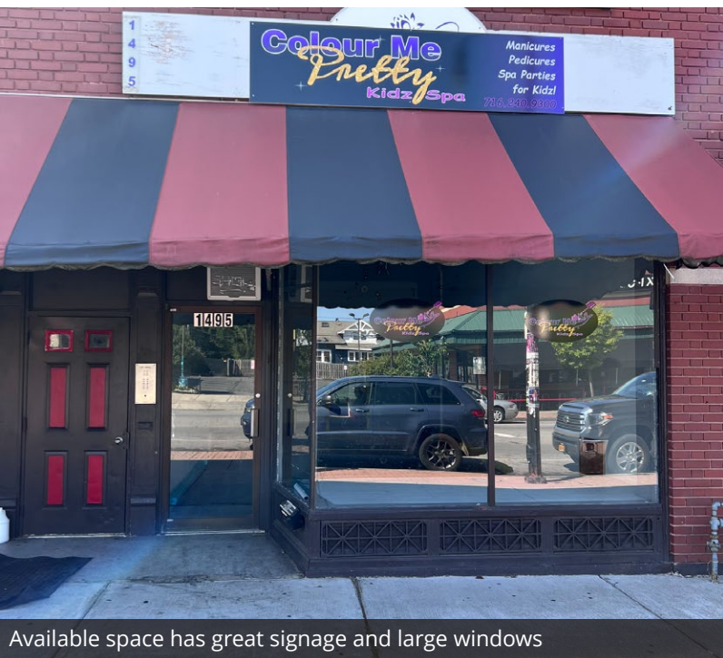
Available space has great signage and large windows