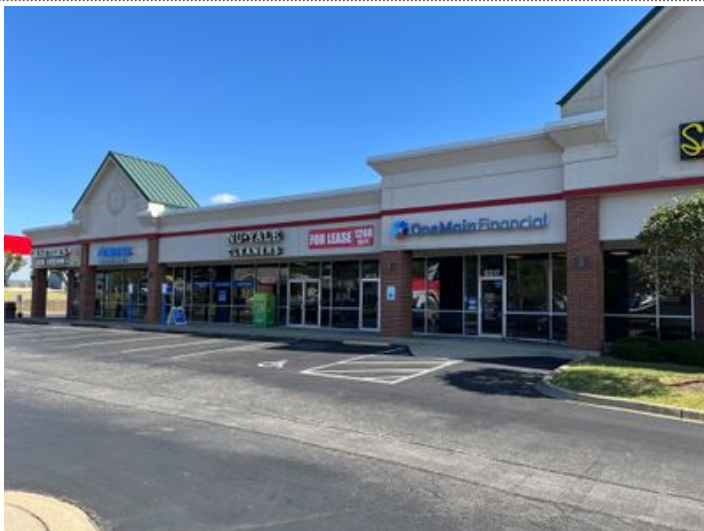
Exterior 2- Seaton Plaza