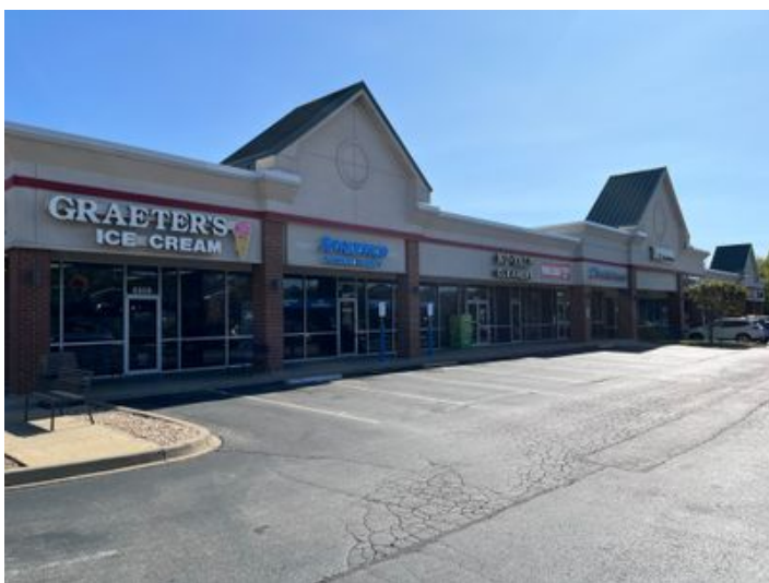
Exterior 3- Seaton Plaza

To View a 2D/3D Interactive Floor Plan, Visit: https://floorplanner.com/projects/147611877/viewer