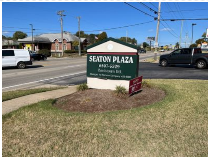
Monument Sign- Seaton Plaza