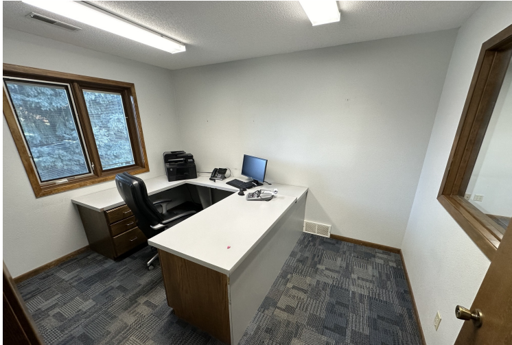
Main Floor Office