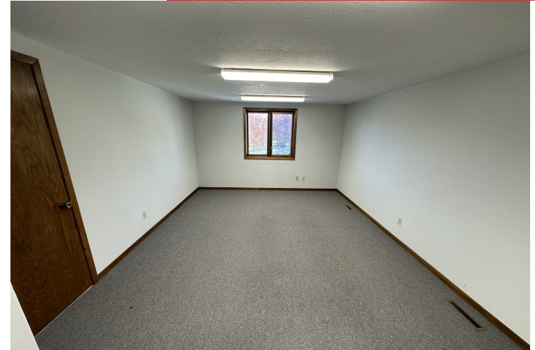
3rd Level Office