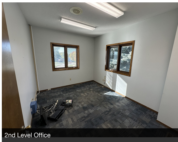
2nd Level Office