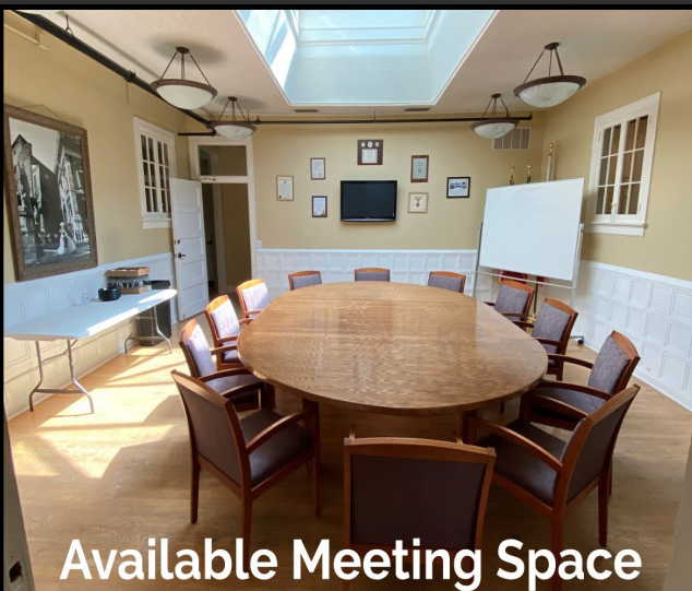
Available Meeting Space