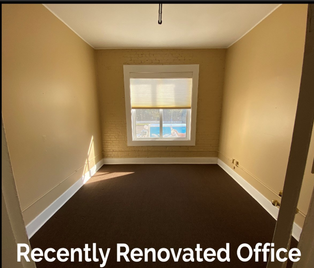
Recently Renovated Office

**this information was acquired through the Ybor City Development Corporation Website and the Ybor City Economic Market Analysis