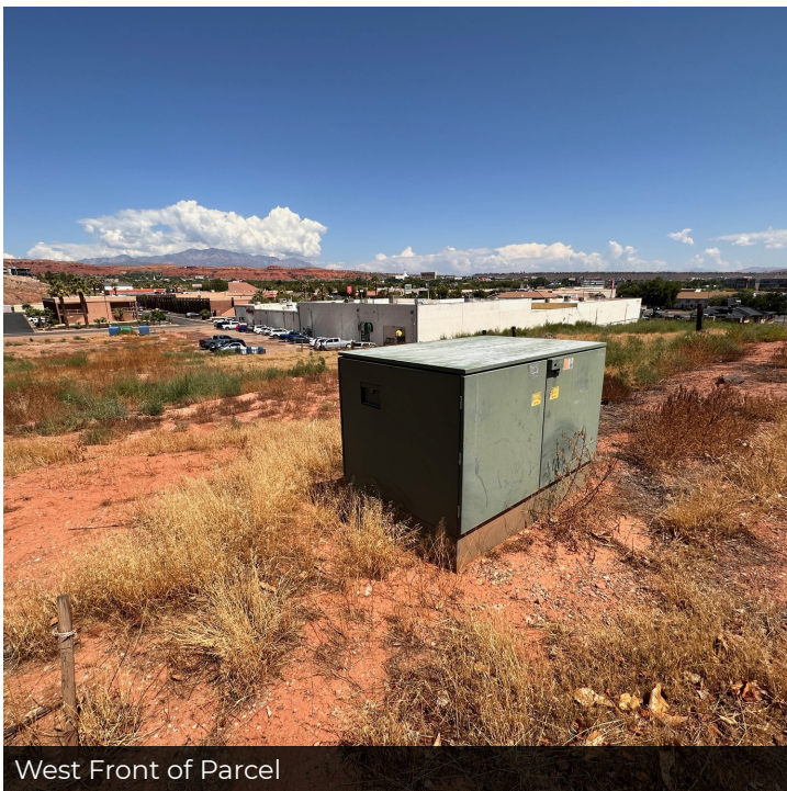
West Front of Parcel