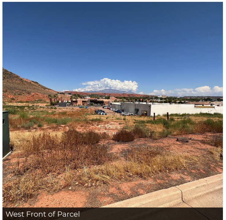
West Front of Parcel