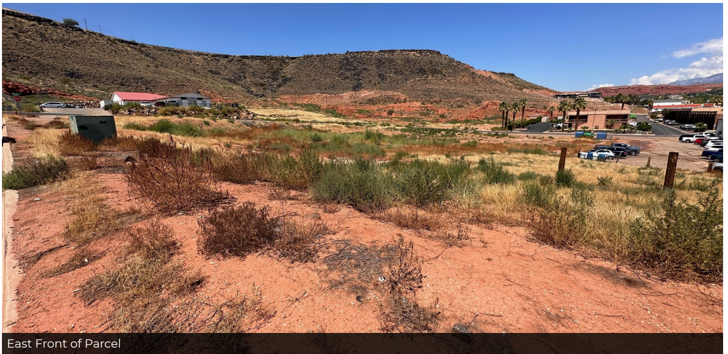
East Front of Parcel