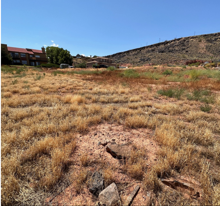
East Rear of Parcel