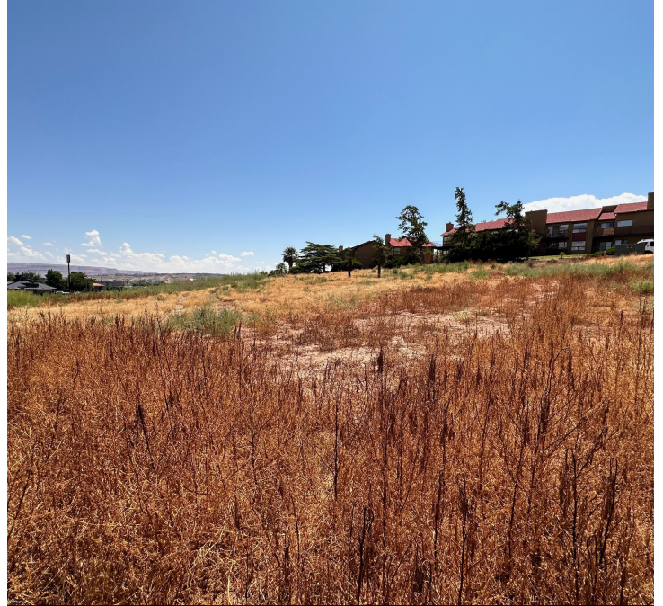
West Rear of Parcel