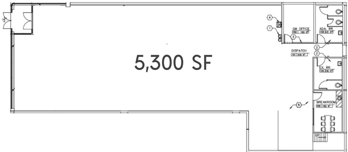
Floor Plan - Space is 5,300 SF