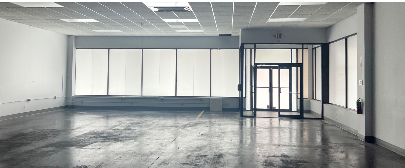
Large windows and vestibule entrance in front of the space