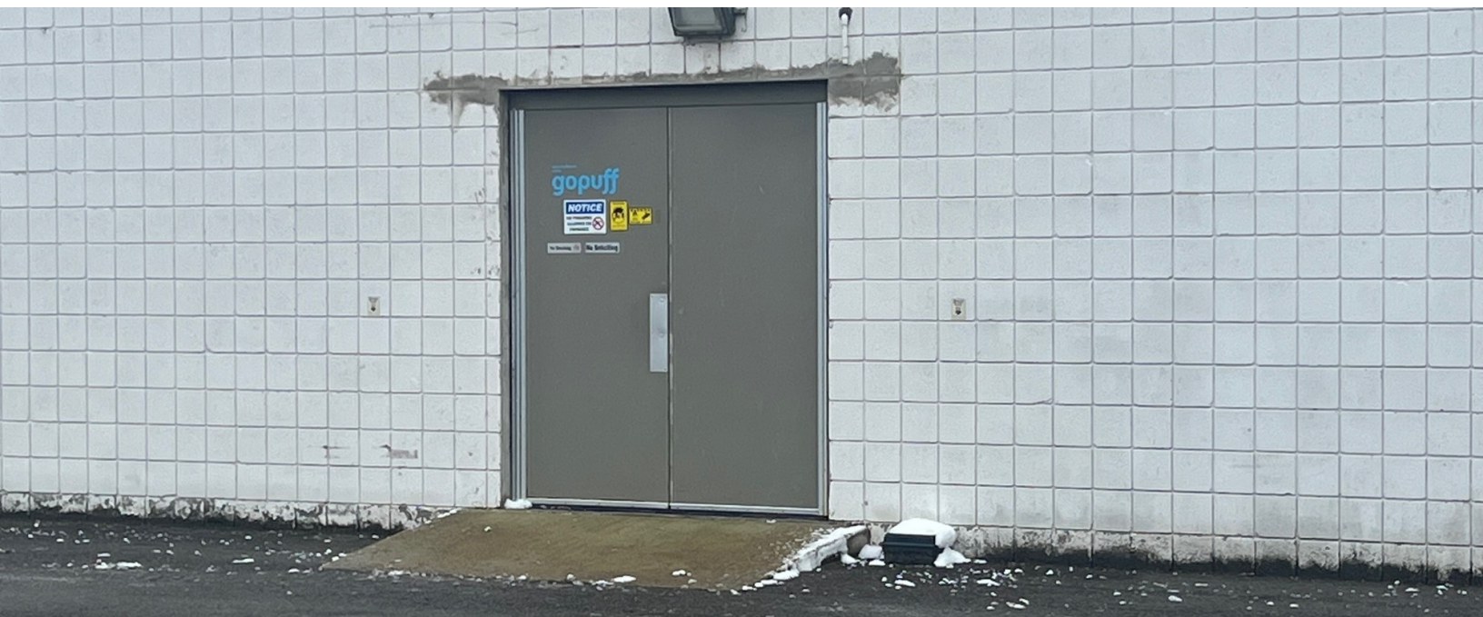
Rear door for loading/unloading