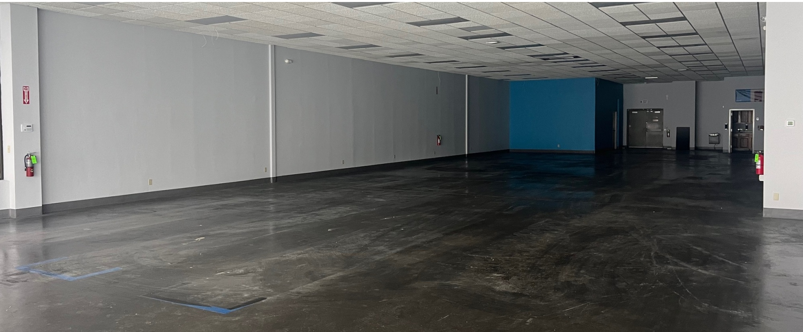
Clean, open space with rest rooms and a double-door in the rear of the space