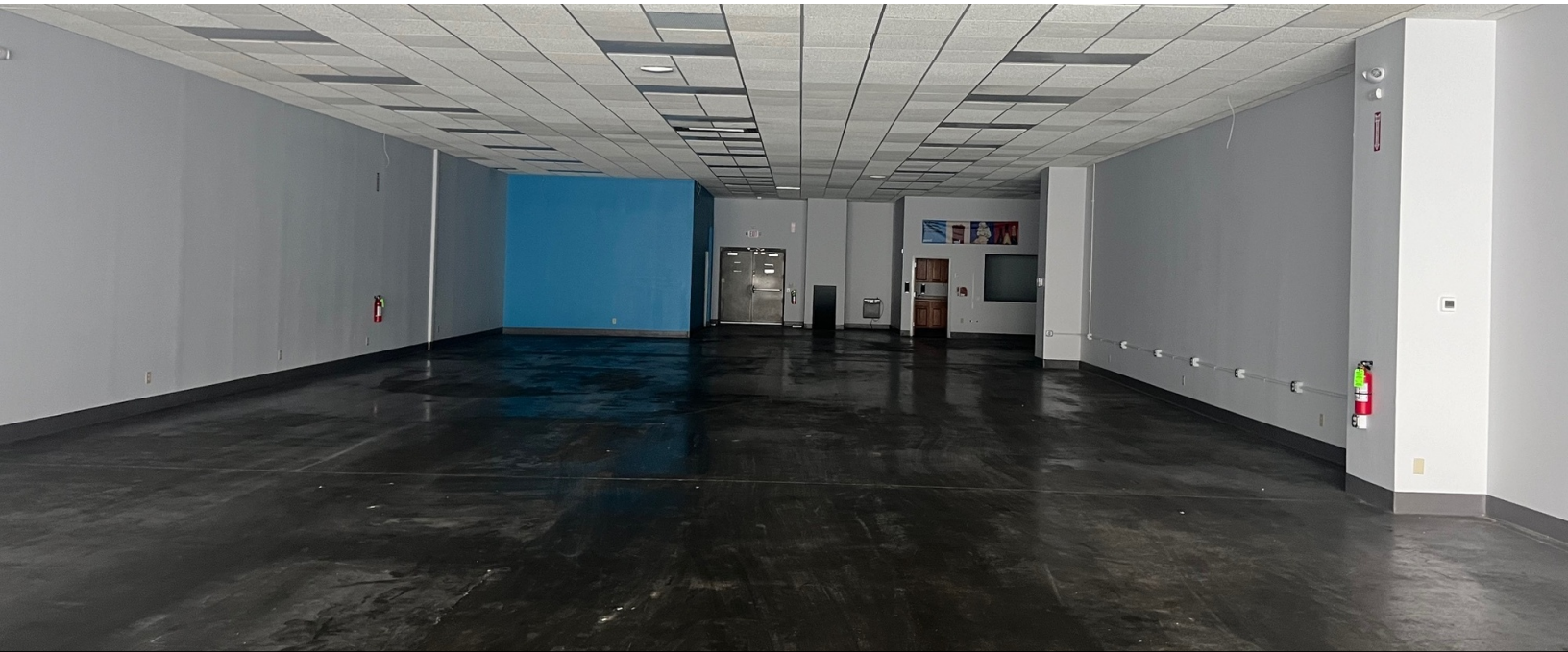
Open floor plan with drop ceiling and polished concrete floor