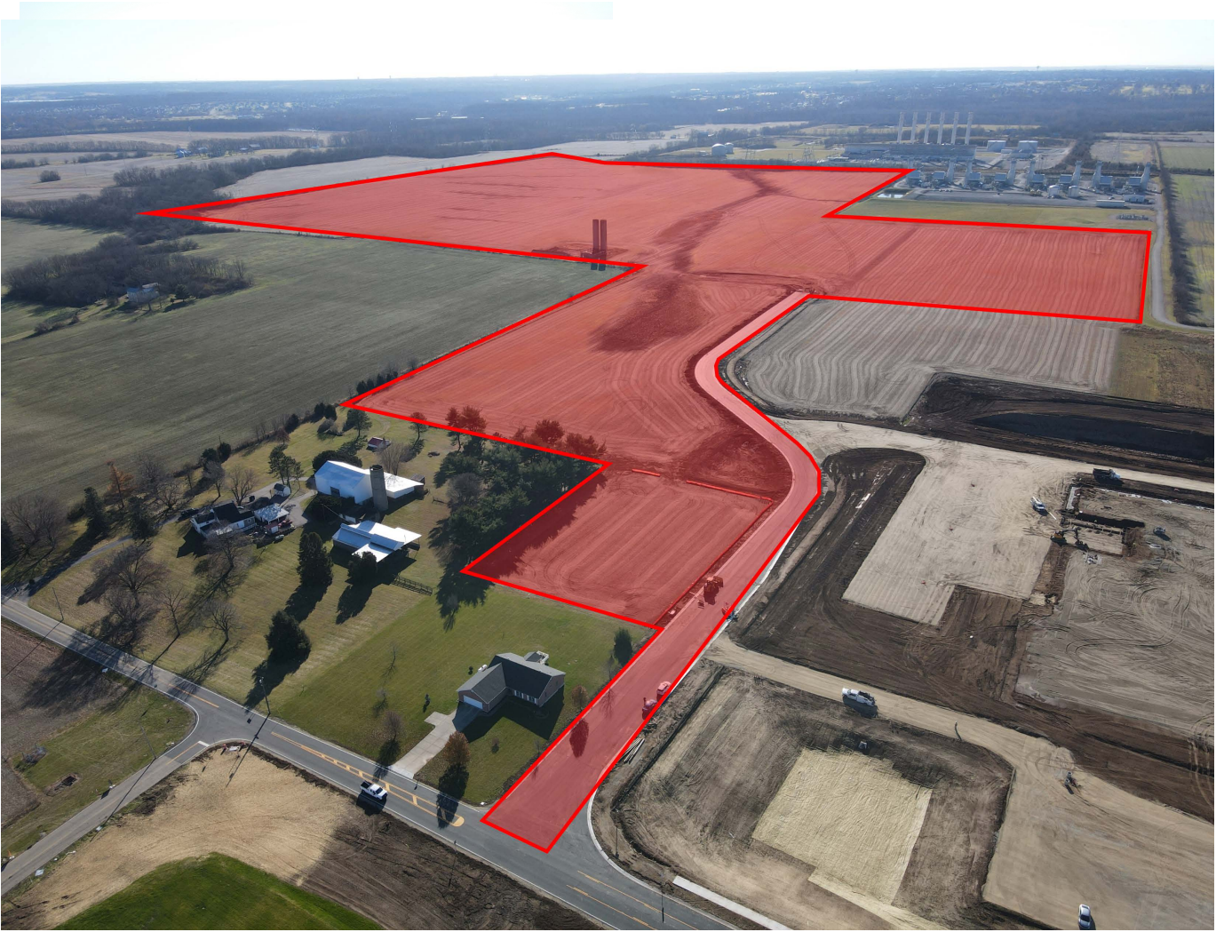
Development Site - South View