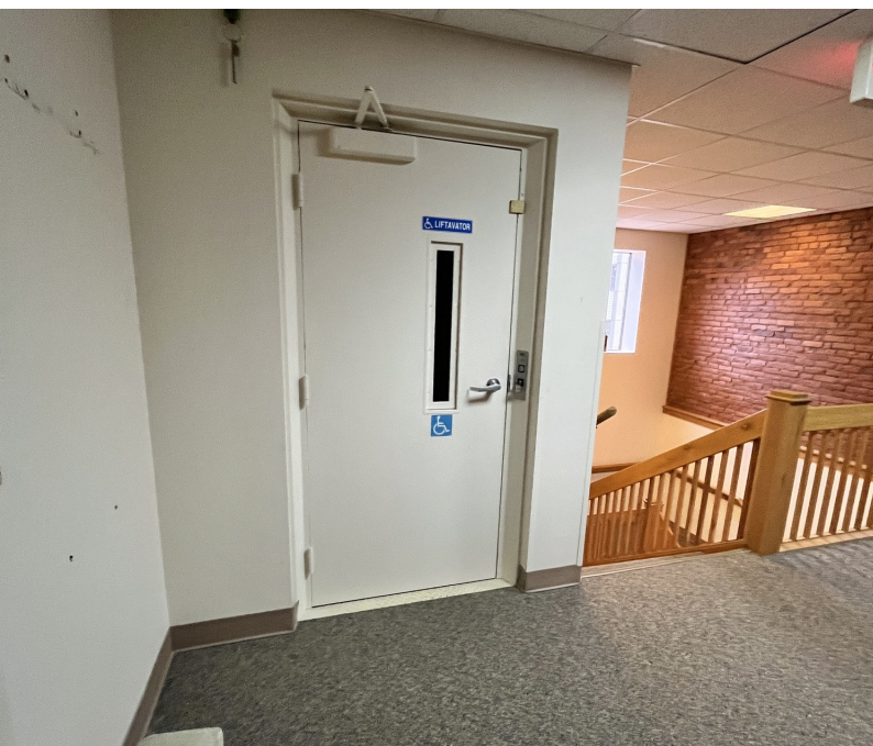
Elevator for access