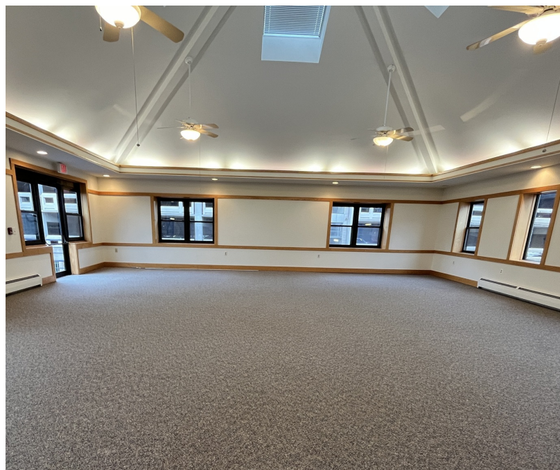
Meeting/conference room has four skylights for added natural light