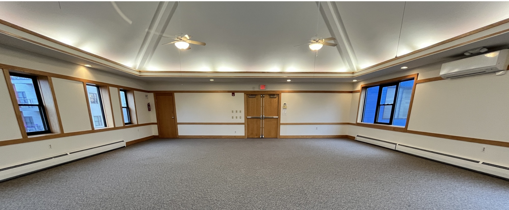
1,150 SF meeting/conference room