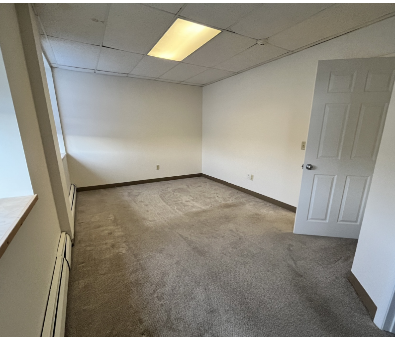
Bedroom off the kitchen/dining area can also be a private office