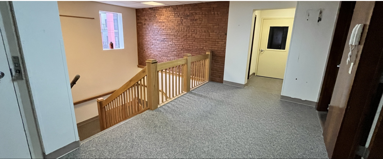
Large foyer at entrance to spaces/rooms