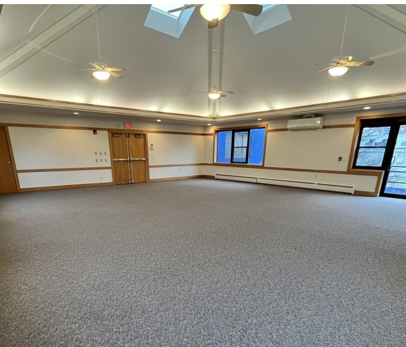
Meeting/conference room has tons of overhead lighting