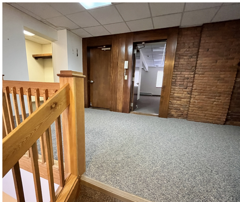
Large foyer is open and inviting