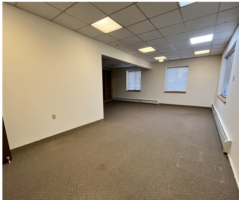
Large room that can be used as shared offices or meeting space