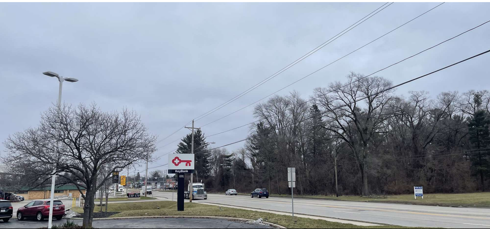
High Visibility from Airport Highway