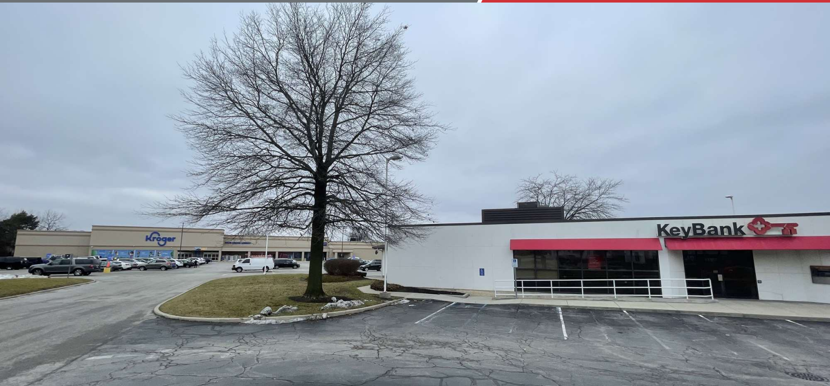
Kroger Outlot Location