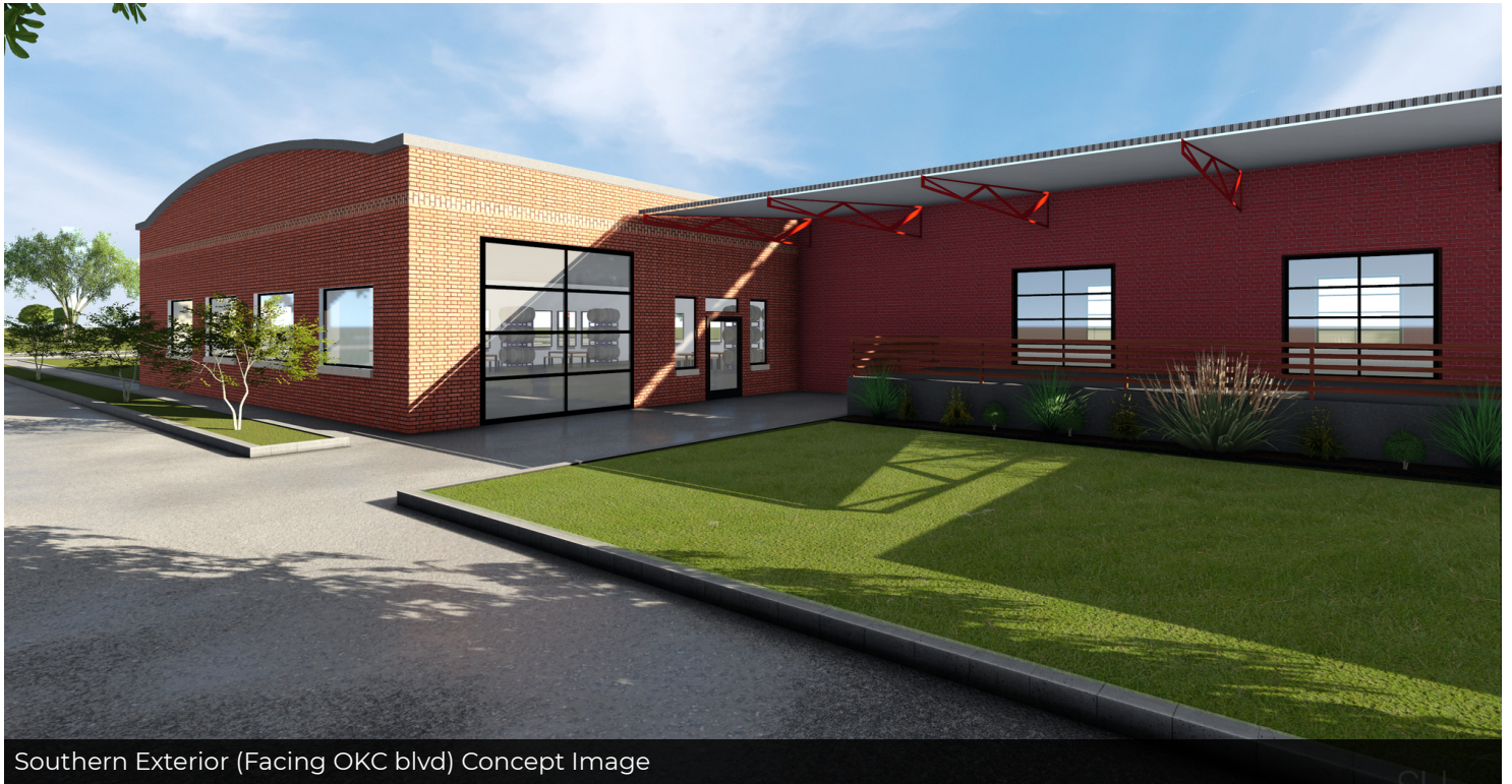
Southern Exterior (Facing OKC blvd) Concept Image