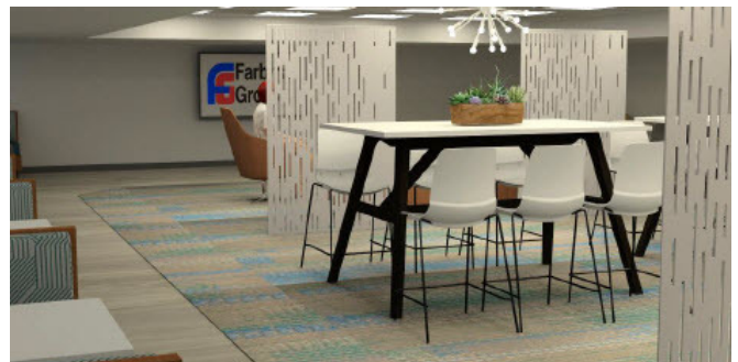
BUILDING LOUNGE AND BREAKROOM!