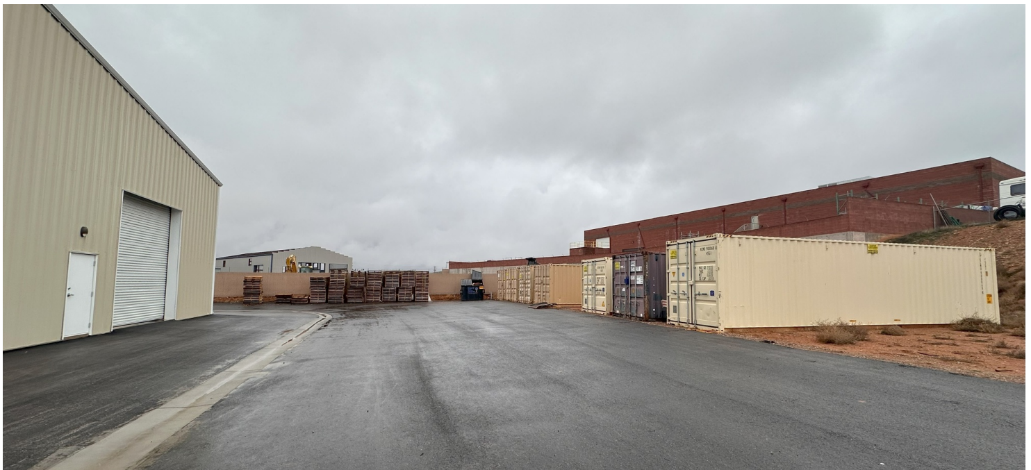
Rear Yard Area