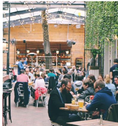
Silo Square 0.6 MILES FROM TOP OF THE SIPP

12 lighted outdoor tennis courts with pavilion and covered seating