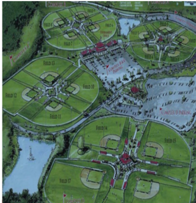
Snowden Grove Park 0.5 MILES FROM TOP OF THE SIPP

The BankPlus Amphitheater is one of the most popular outdoor entertainment venues in the Mid-South. With recent 10-million-dollar renovations, this 7 acre, 125,000 square foot treasure has expanded to just under 10,000 permanent seats, with new premium box seating and VIP lounge.