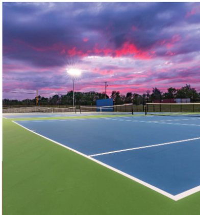
Snowden Grove Tennis Center 1 MILE FROM TOP OF THE SIPP

7 outdoor full sized soccer fields, with lighting for nighttime play