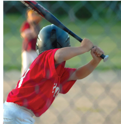
BankPlus Sports Center 0.4 MILES FROM TOP OF THE SIPP

One of the premier youth baseball facilities in the United States, housing 17 turf baseball fields with state-of-the-art features previously only found at professional stadiums. Hosts numerous baseball tournaments including youth world series events.