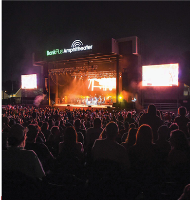
BankPlus Amphitheater 0.5 MILES FROM TOP OF THE SIPP

The BankPlus Amphitheater is one of the most popular outdoor entertainment venues in the Mid-South. With recent 10-million-dollar renovations, this 7 acre, 125,000 square foot treasure has expanded to just under 10,000 permanent seats, with new premium box seating and VIP lounge.