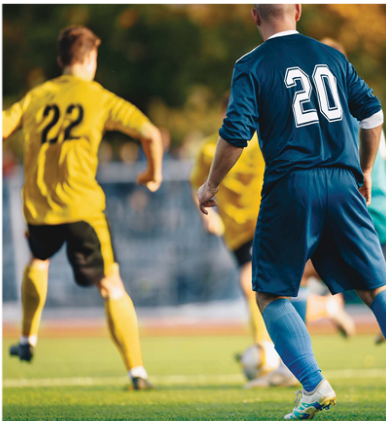
Snowden Grove Soccer Center 0.25 MILES FROM TOP OF THE SIPP

This indoor sports complex attracts all ages in the community. Home to soccer fields, baseball and softball practice facilities, batting cages and batting tunnels, a sports shop, and two outdoor 18-hole miniature golf courses.