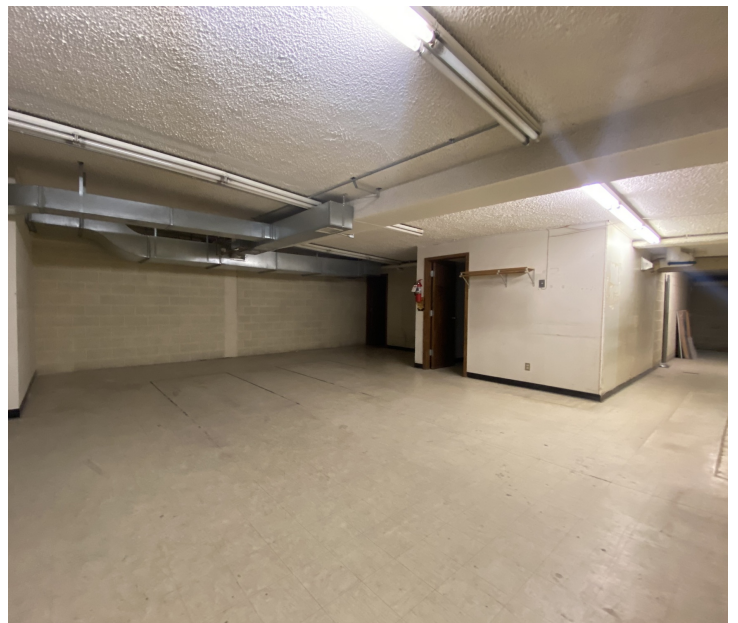
Separate Storage / Break Room