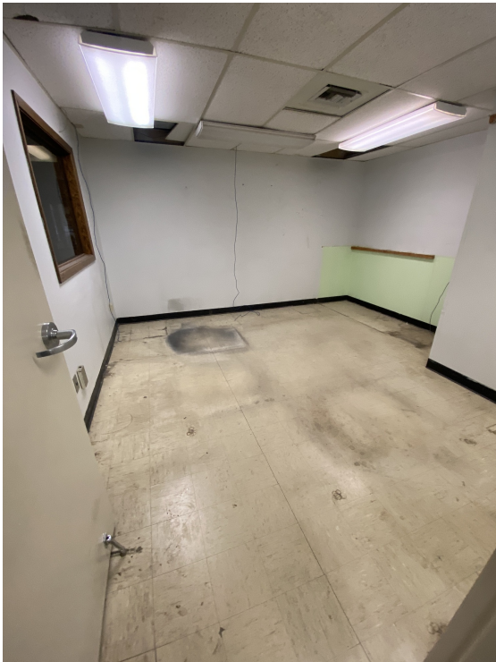
Separate Individual Office