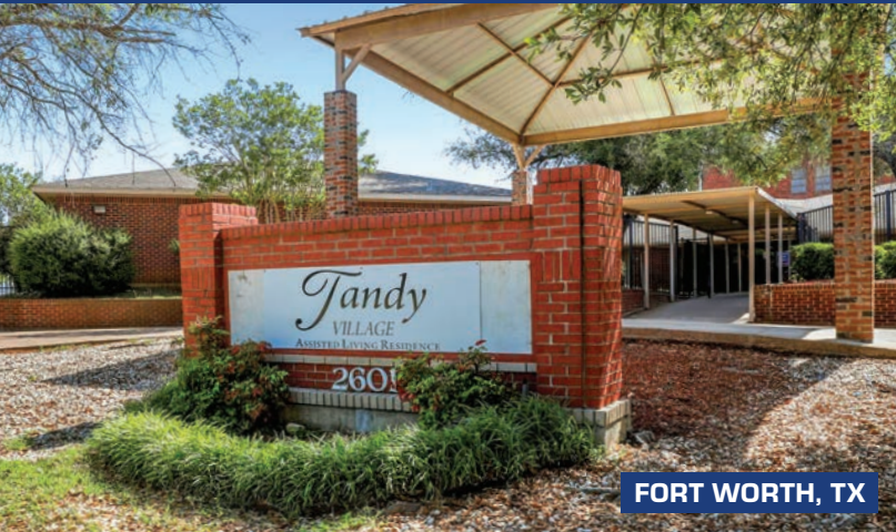
FORT WORTH, TX