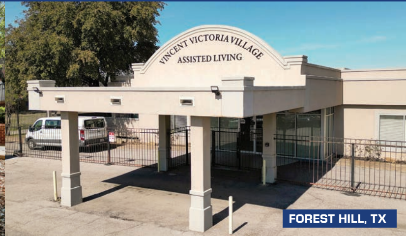
FOREST HILL, TX