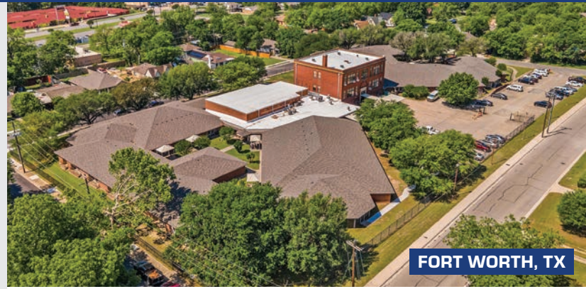
FORT WORTH, TX