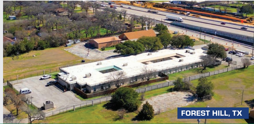
FOREST HILL, TX