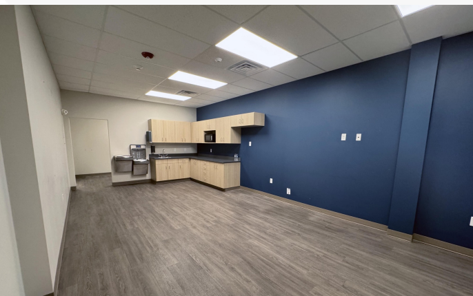
Large break room