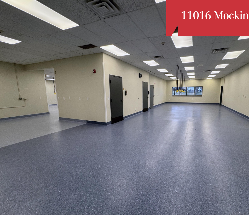
Open Flex Space with 5 private testing rooms

11016 Mockingbird Drive Suite #101-103 | Omaha, NE 68137