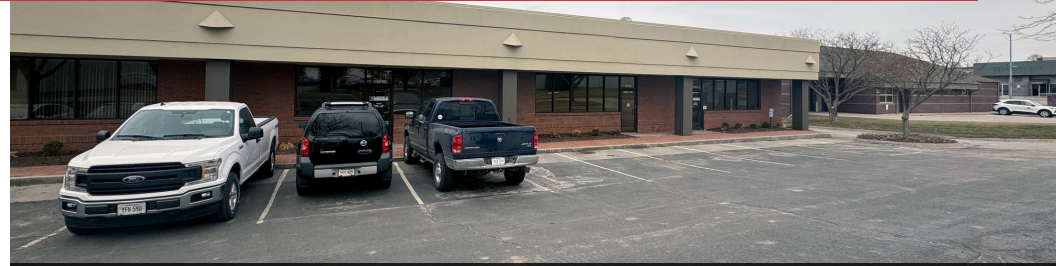
Storefront parking (additional parking in back of building)