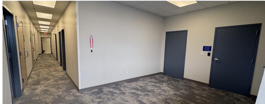
Reception, 3 private offices, conference room, ADA restrooms, & break room