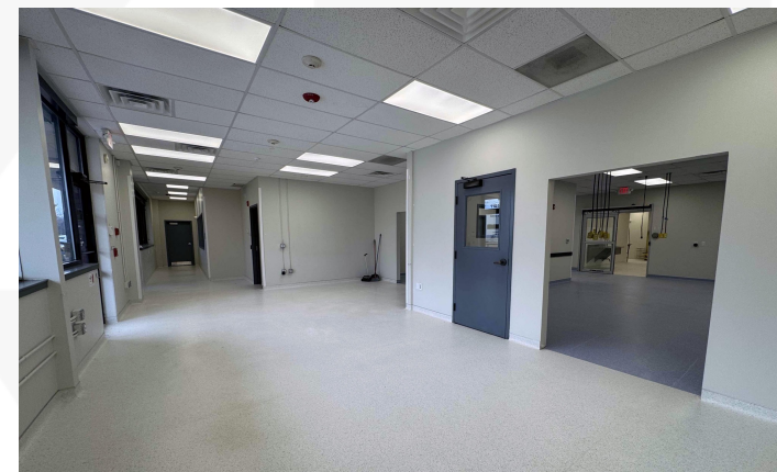
Entrance to open flex space