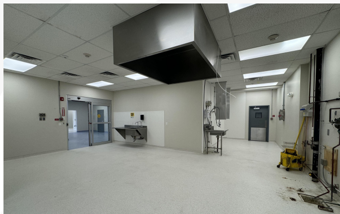
3 hoods, 3 sinks, & eye washing station