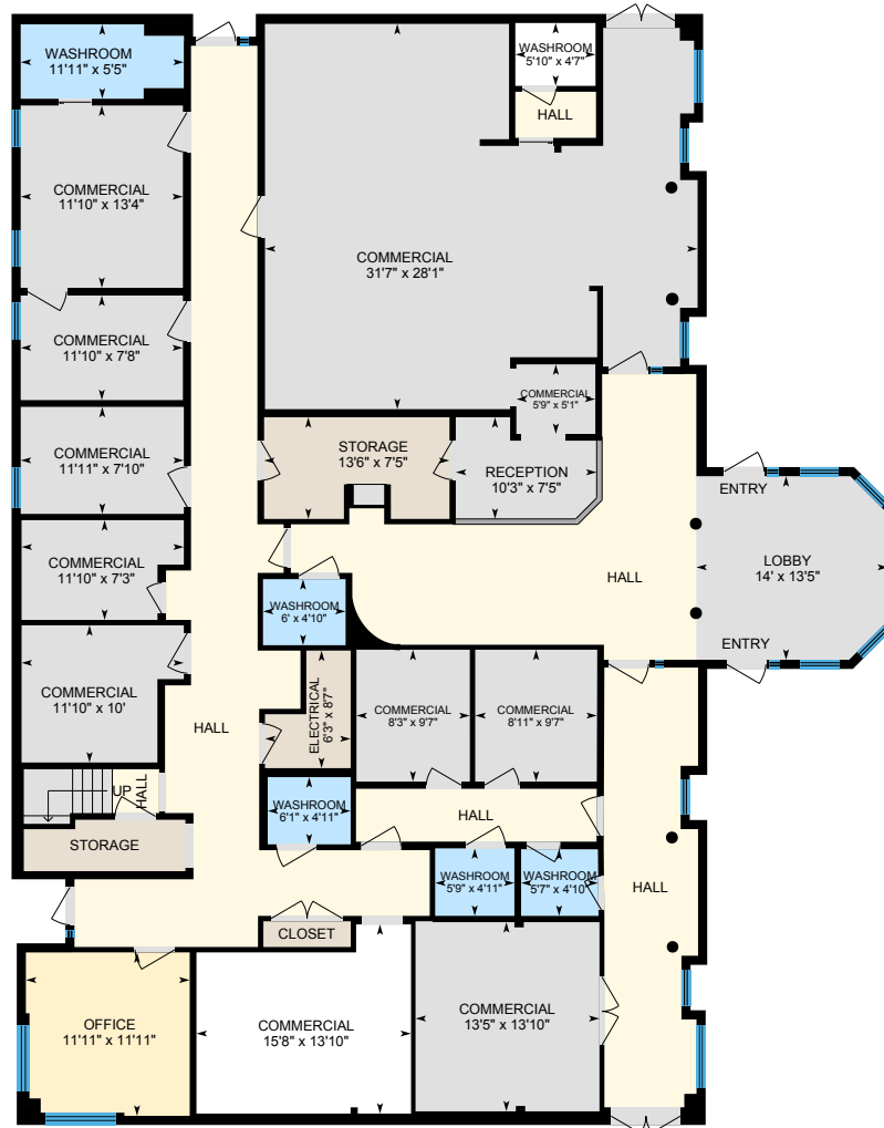
Main Floor Finished Area 3998.90 sq ft

Main Building: Total Finished Area 4367.55 sq ft