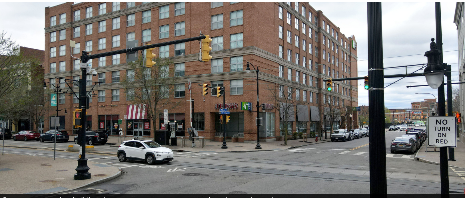
Restaurant space has building signage on two street corners, and outdoor patio seating