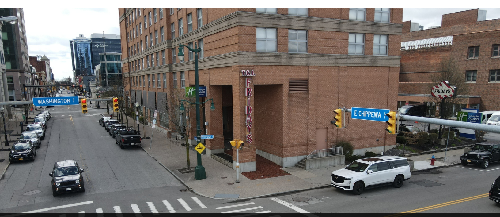
Restaurant space has building signage on two street corners, and a pylon sign