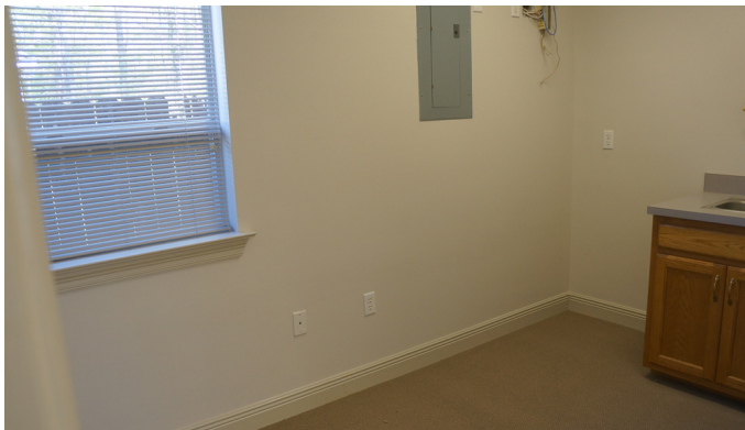
KITCHENETTE EFFICIENCY IN REAR OF SUITE