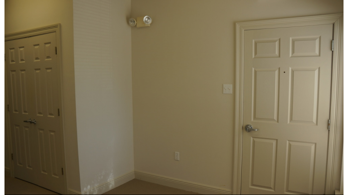
ENTRY TO SUITE, STORAGE CLOSET ON LEFT