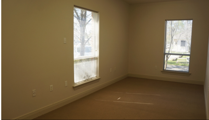
RECEPTION AND ENTRY