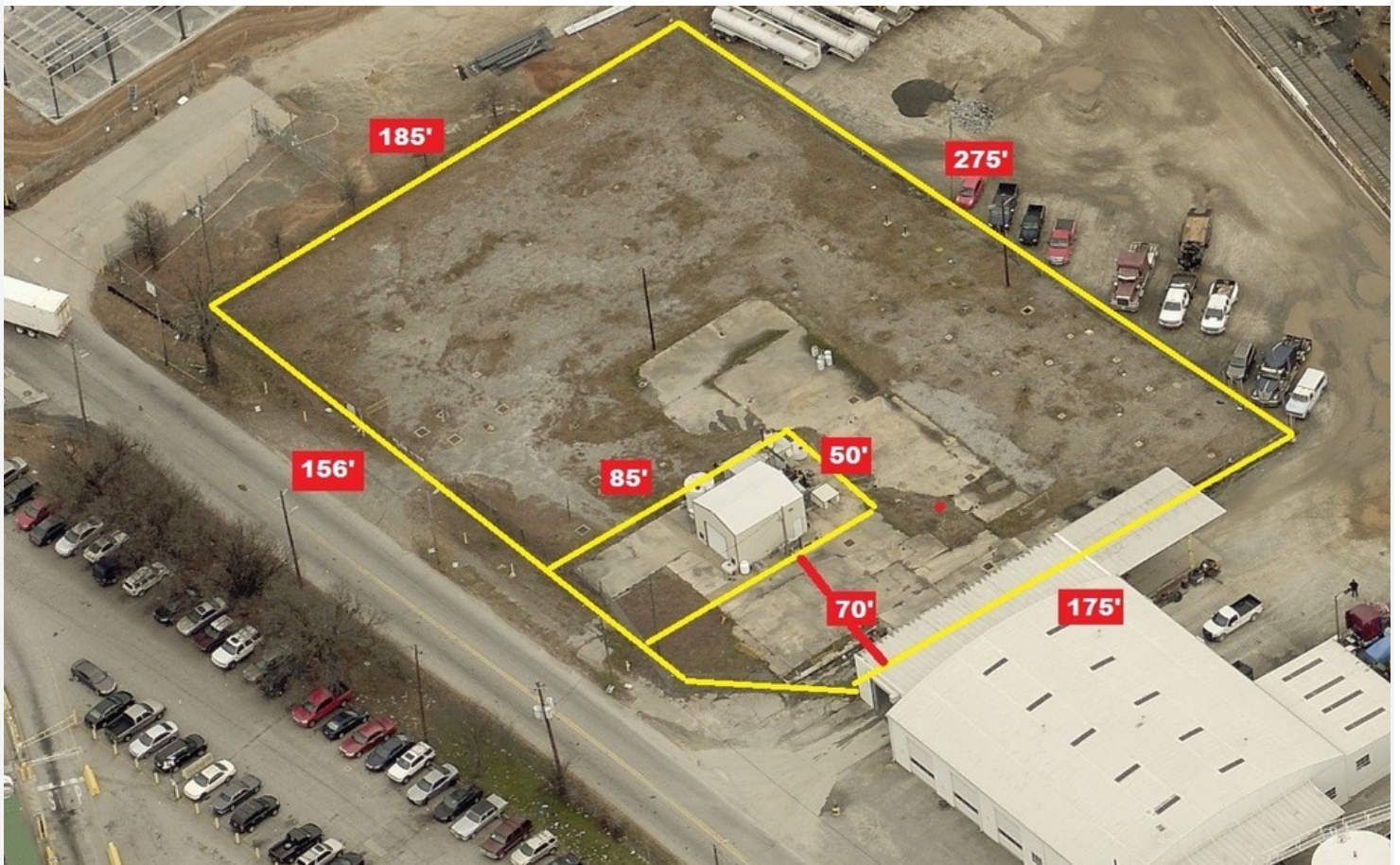
Aerial with Dimensions