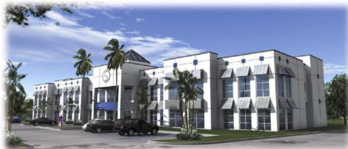
South Orlando Professional Center