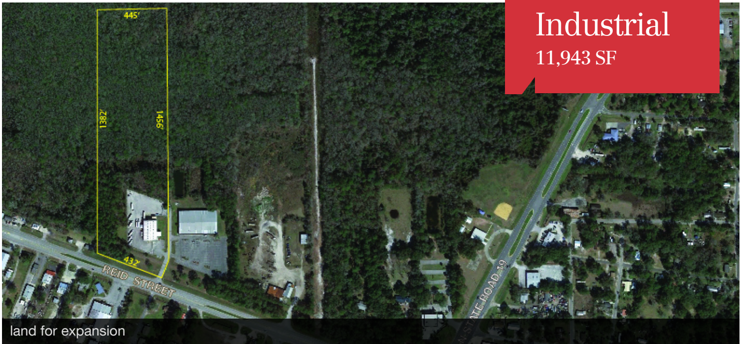
land for expansion