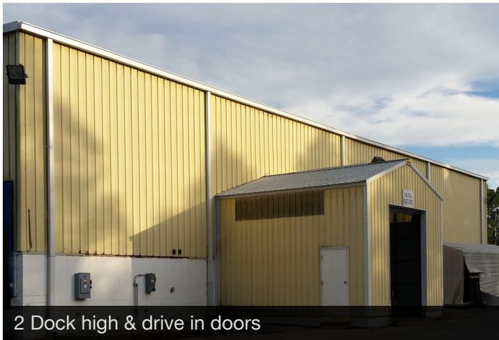
2 Dock high & drive in doors