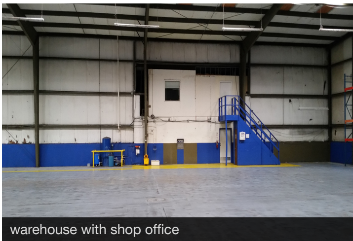
warehouse with shop office