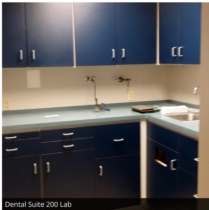
Dental Suite 200 Exam Room