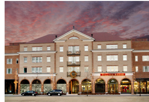
Plan > Vision > Built Market Square surrounded by restaurants, shops, and student apartments, and which hosts numerous community and college events.