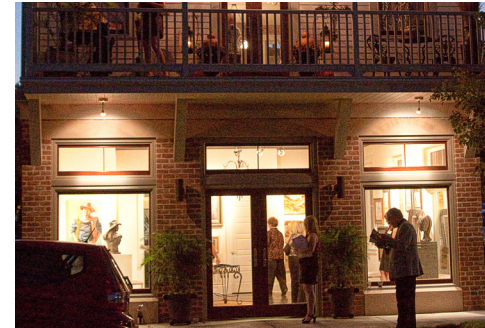
Plan > Vision > Built Live/work units transition the neighborhood between Market Square and the residential homes.