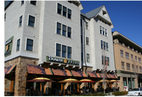
Plan > Vision > Built Mixed-use building on Market Square with ground floor retail and student apartments above.