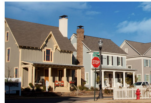
Plan > Vision > Built Single-family residential homes.