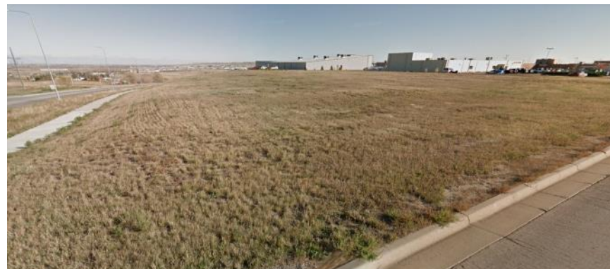
Street view from Mall Dr & Maple Ave