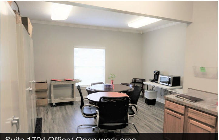
Suite 1704 Office/ Open work area