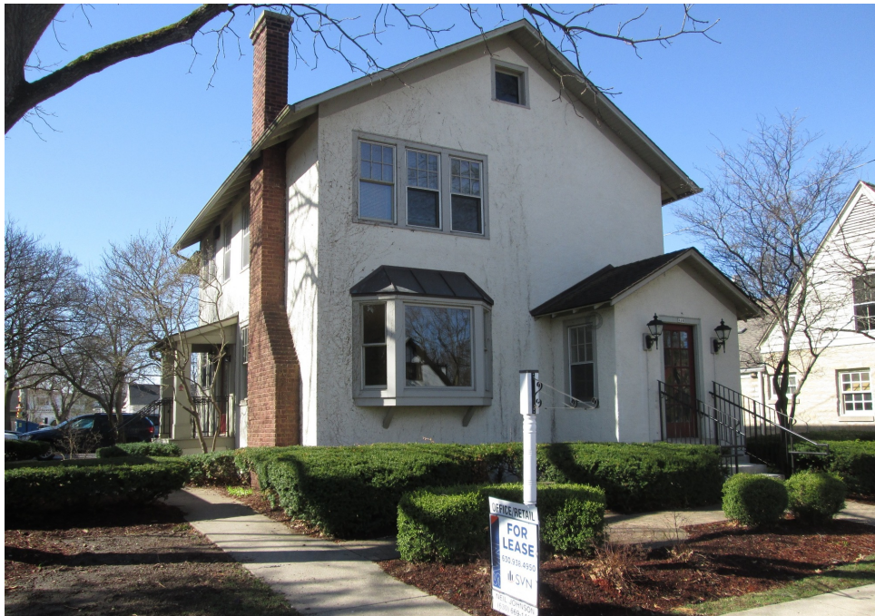
View from Street