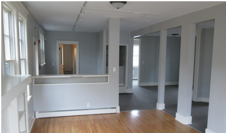
View to Rear