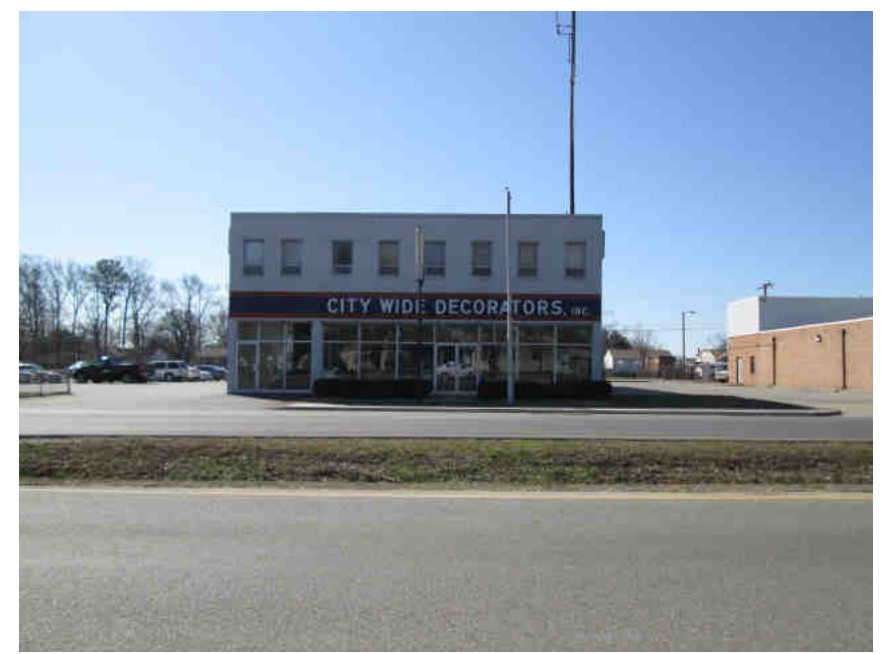
Last Photo Update 03/17/2014