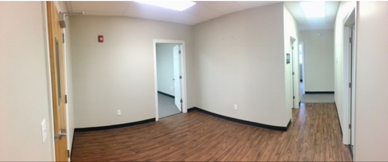
Executive Suite 203 Entry