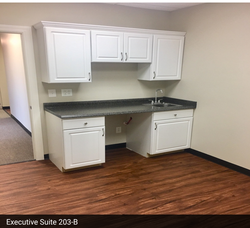
Executive Suite 203-B