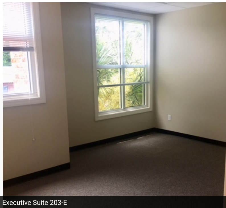
Executive Suite 203-E