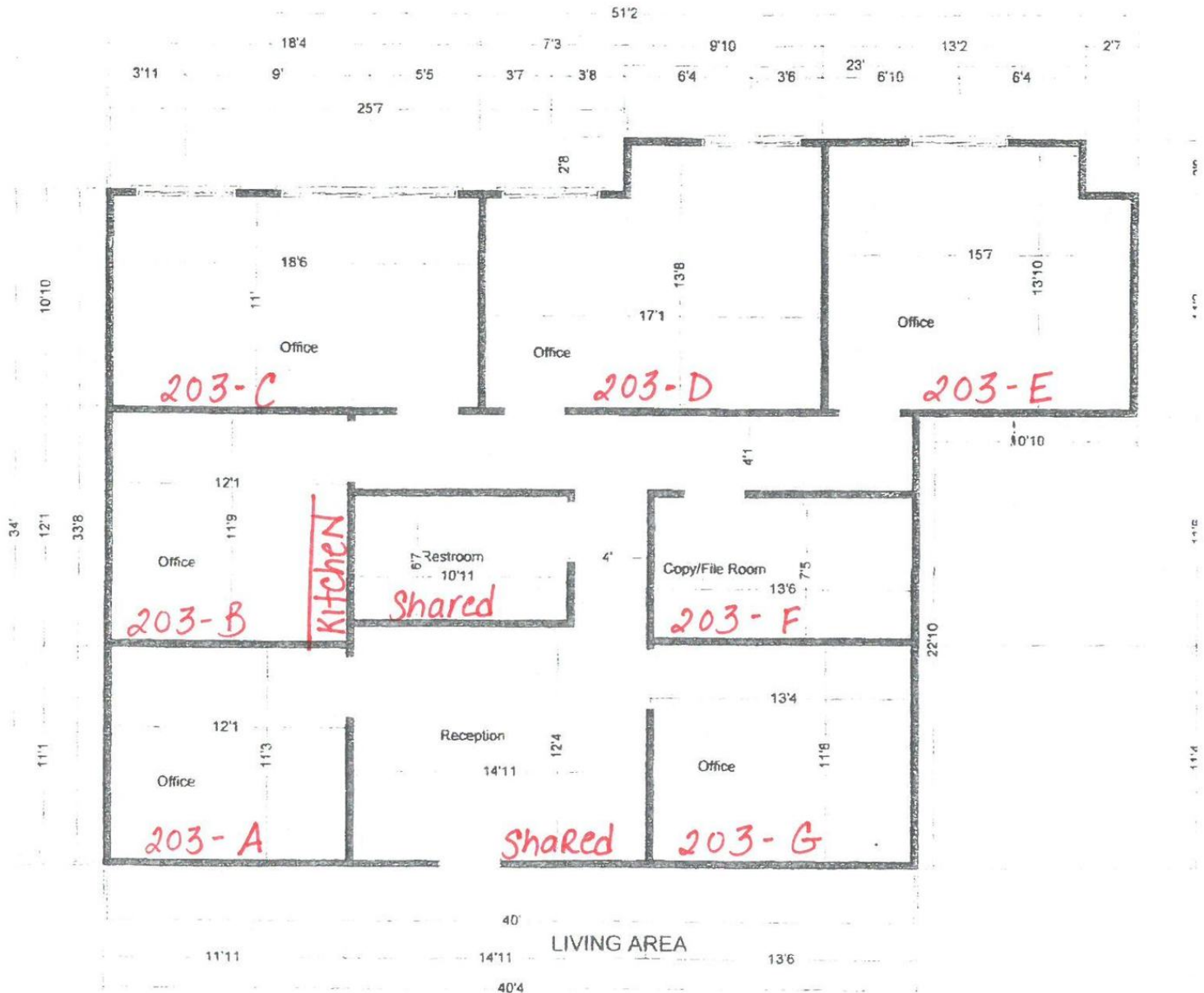
Suite 203; Executive Suites