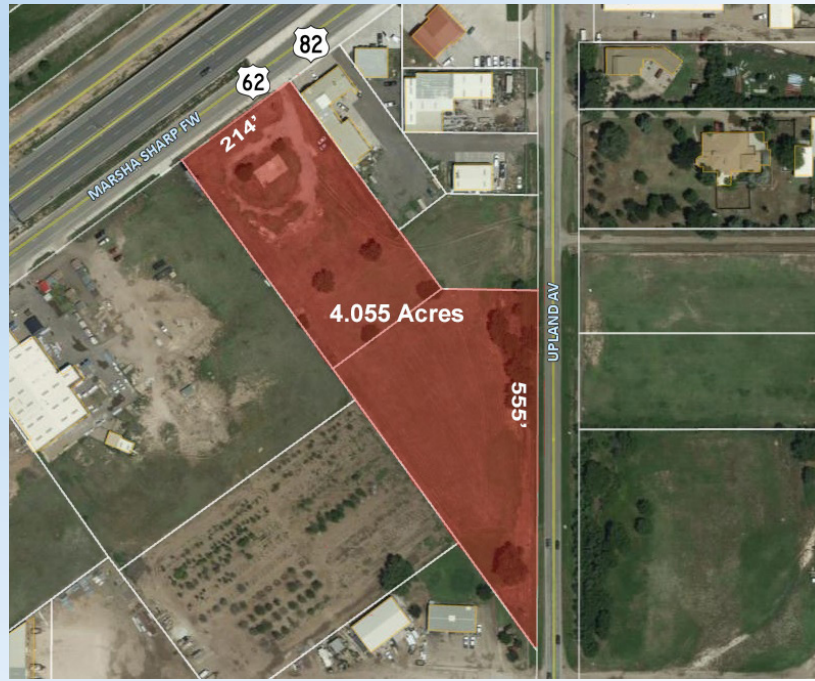
4.055 Acres In Two Tracks