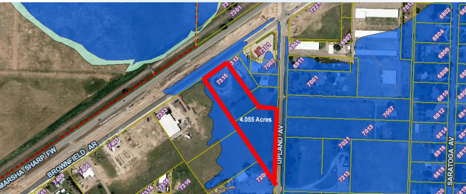
Flood Base Map