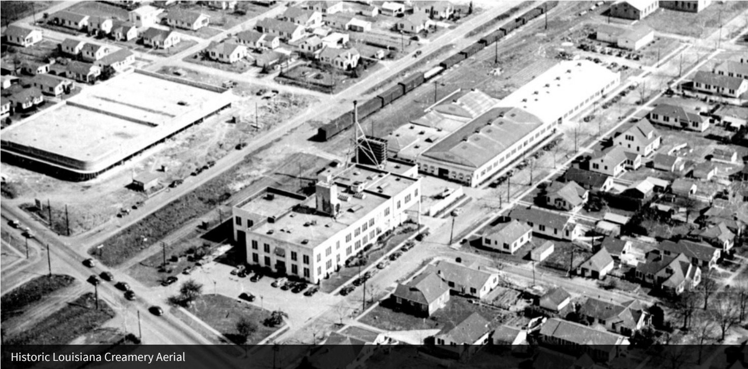
Historic Louisiana Creamery Aerial