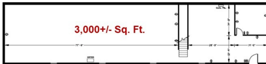
② BASEMENT LEVEL

KW COMMERCIAL 804 Town Blvd., Ste. A2040 Atlanta, GA 30319