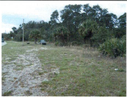
Eastern Boundary of Subject Property, Adjacent to Barna Avenue