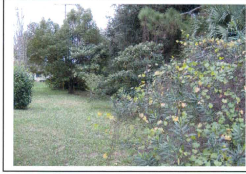
Southern Boundary of Subject Property, Adjacent to Residential Development