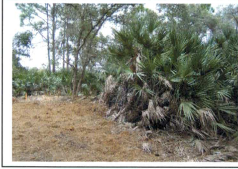
View of the Pine and Palmetto