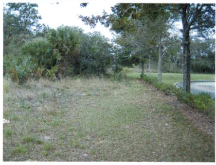
Northern Boundary of Subject Property, Adjacent to Bank