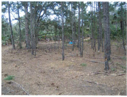
View of the Pine and Palmetto