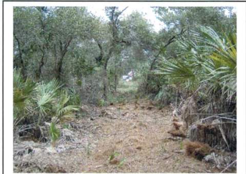
Typical View of the Palmetto and Oak Scrub