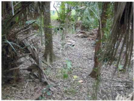
Less than 0.5 Acre Wetland Identified in Southern Portion of Subject Property