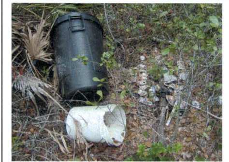
Human Impacts Identified at the Subject Property