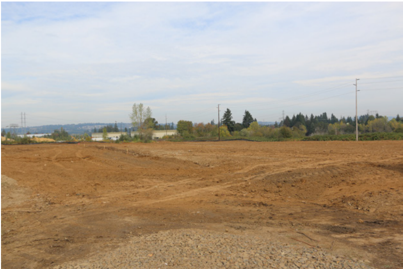
Site Grading Underway