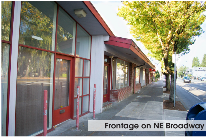
Frontage on NE Broadway