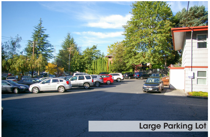
Large Parking Lot