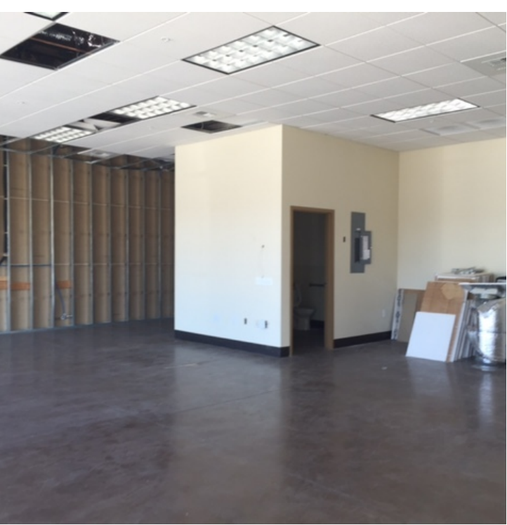
KW COMMERCIAL 7777 Alvarado Rd., Suite 702 La Mesa, CA 91942