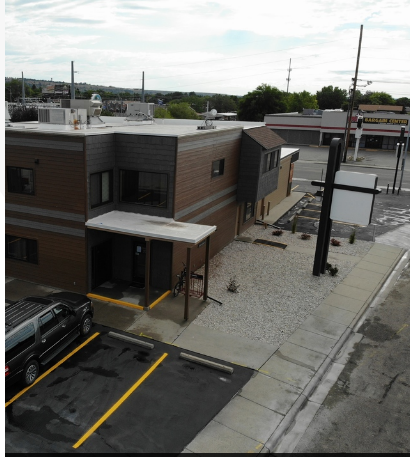
Brand New Landscaping and Concrete