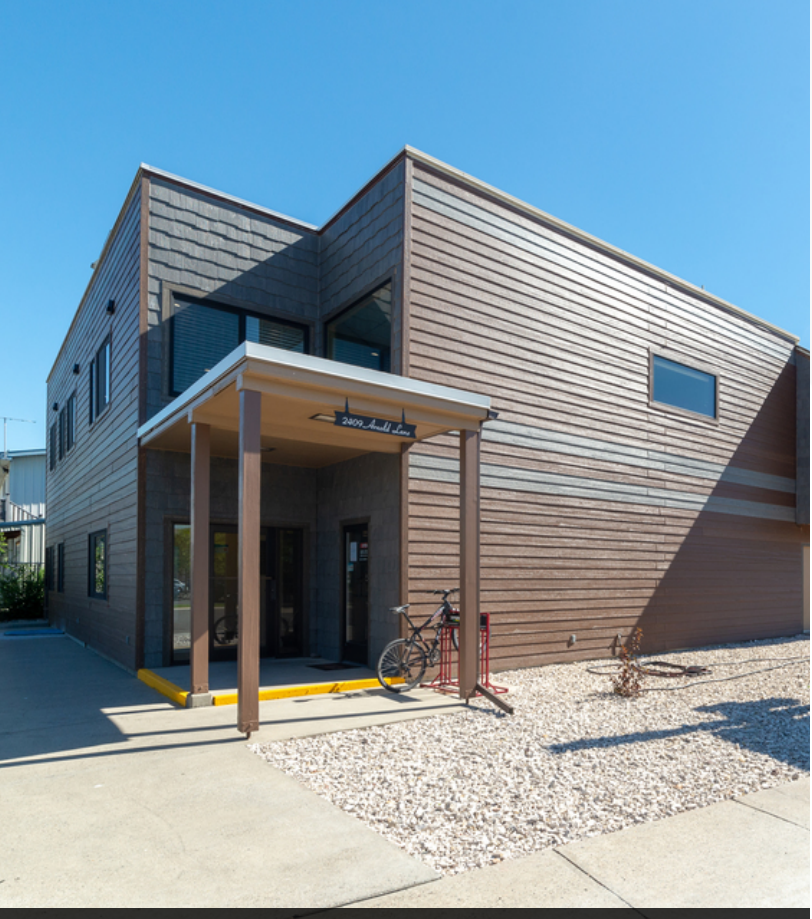
Brand New Siding