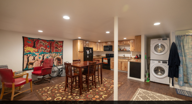
Basement Apartment, All Brand New Finishes