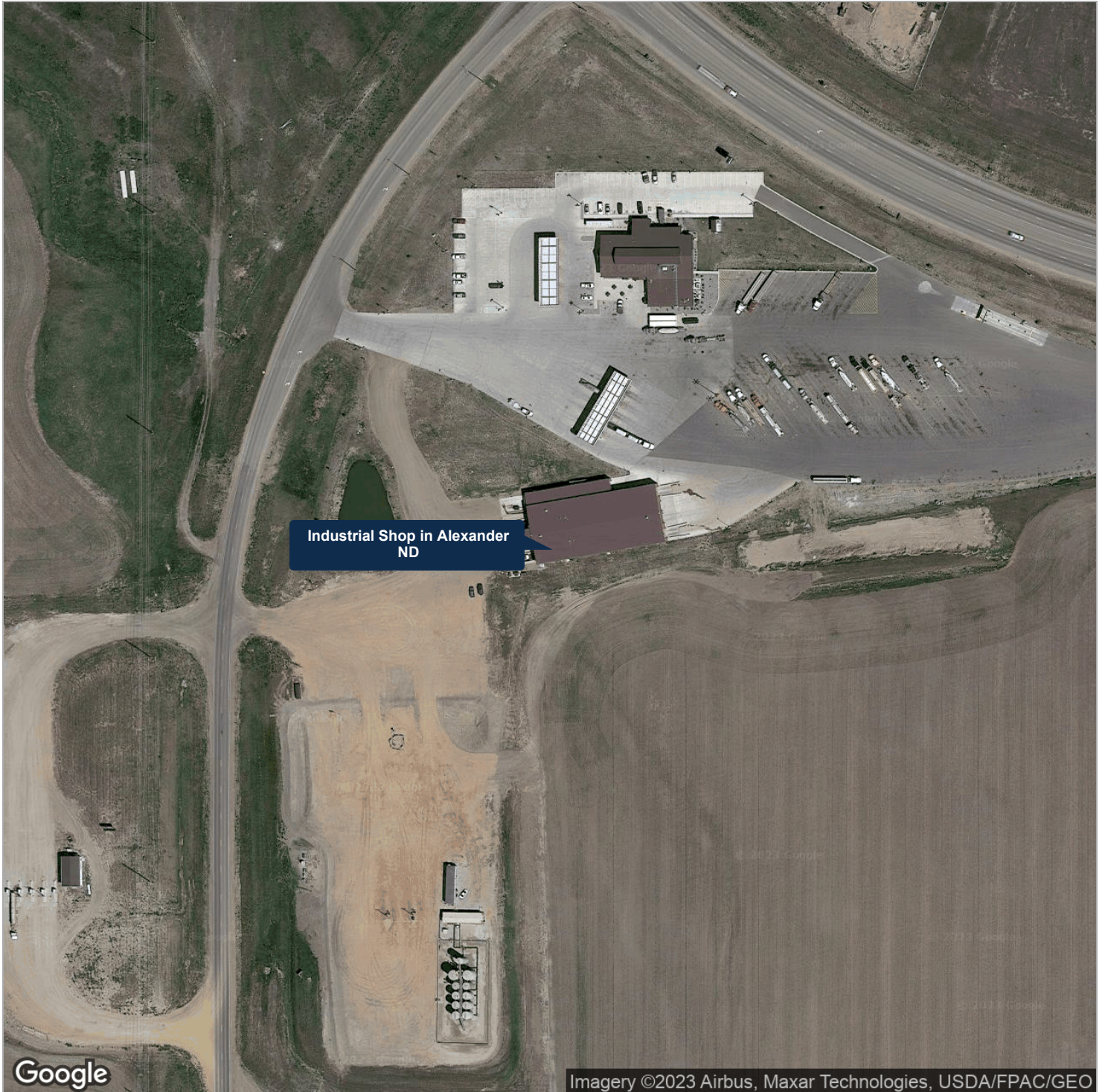
Industrial Shop in Alexander ND